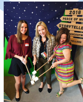
The Flawless Team having fun at PeaceLove