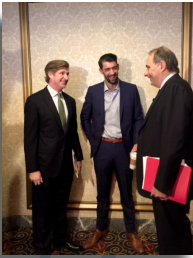
Patrick Kennedy, Michael Phelps, David Axelrod