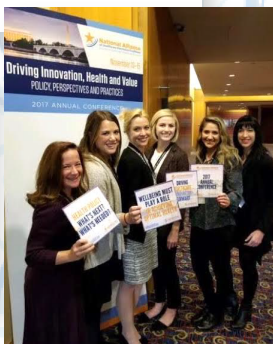
Our Flawless Team at #NatlAllCon in Washington D.C.