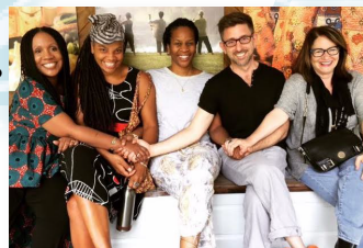
Our colleagues from Yale Center for Emotional Intelligence & Thurgood Marshall Academy, sporting their flawless tattoos.

The news cycle allowed us to put a special emphasis on developing and applying emotional intelligence, particularly in the context of processing and responding to media and challenging events. Through modeling emotional intelligence in our communications and providing resources on topics such as explaining difficult events to children, talking about distressing news, and finding common ground with people with whom we disagree—we are advancing our mission of creating a more flawless, accepting world.