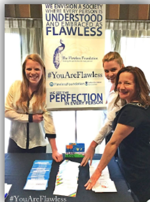
Our team sporting Flawless tattoos

This year we collaborated with like-minded individuals and organizations, reinforcing one another’s messages to reach a broader audience. These partnerships have led to huge impact, much more than any of us could have achieved alone. And through our communications consulting with Flawless Strategies, we’re empowering our clients — who share our mission of promoting prevention and holistic brain health — to articulate the strength of their voice on a larger platform as well.