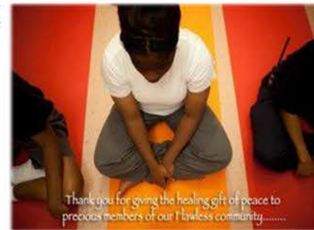
A Lineage Project participant in our summer intensive yoga/mindfulness program at a juvenile detention center.