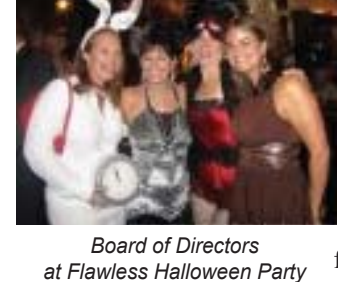
...and a big thank you...

advice and selections of beautiful material and information to assist you in joining our holiday giving campaign this season.