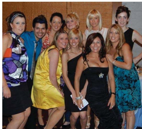
Alice Hair staff at Perfection Party at the Millennium Hotel

Thank you to all our extraordinary corporate sponsors!